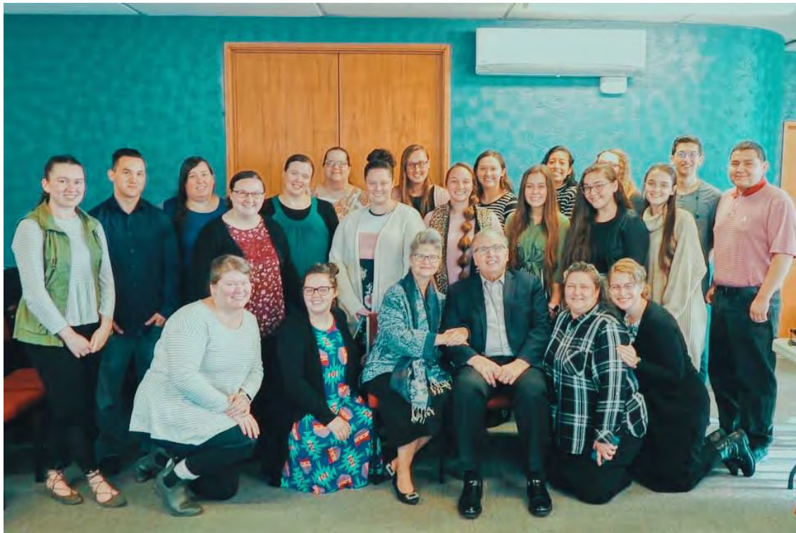
The Next Steps New Zealand Team.